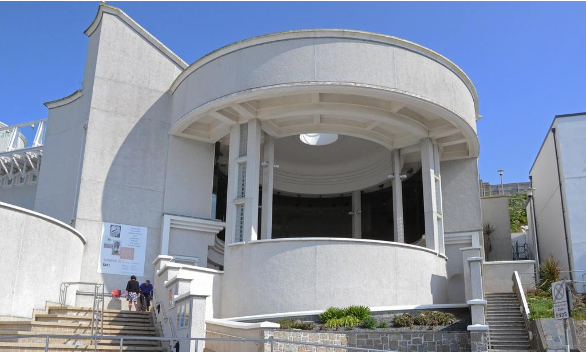
Tate Gallery, St Ives