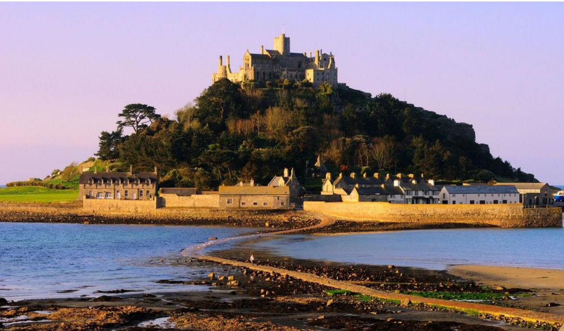
St Michael's Mount, Marazion (Penzance)