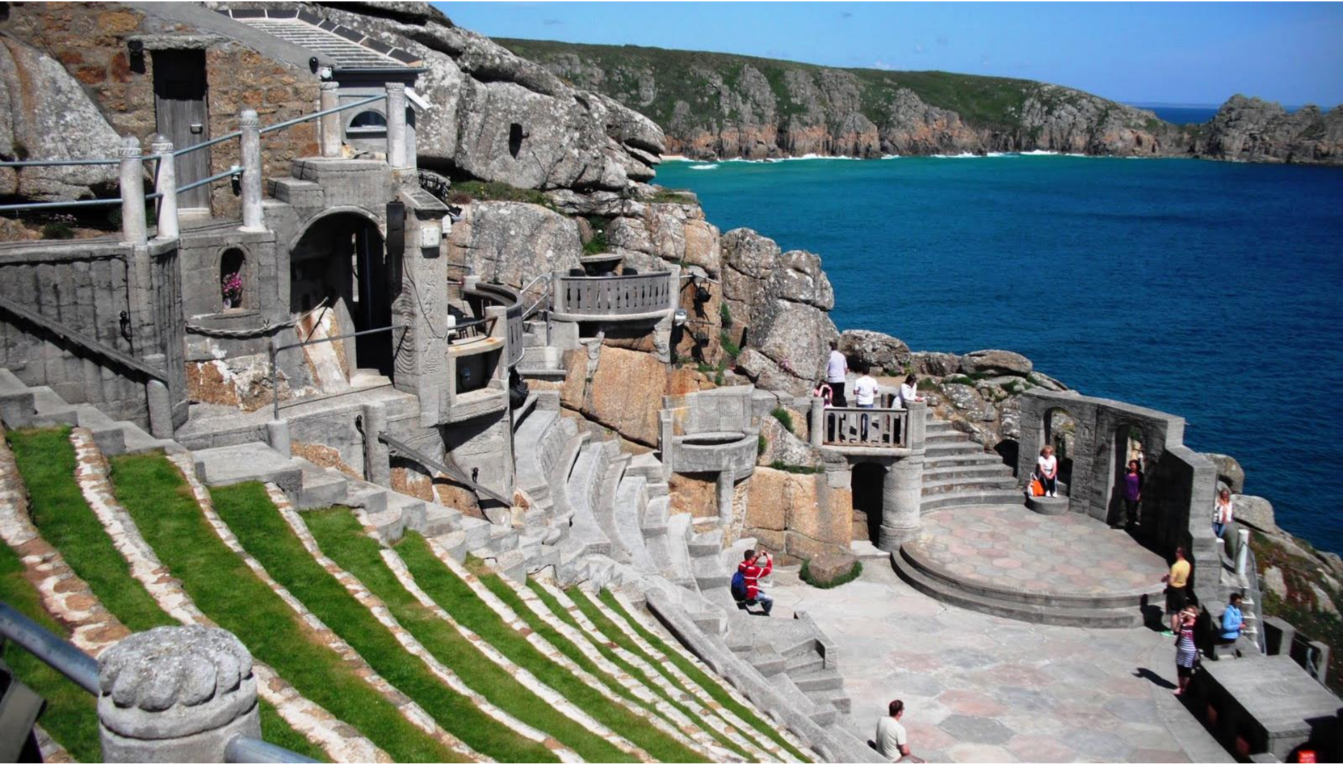
Minack Theatre, Porthcurno