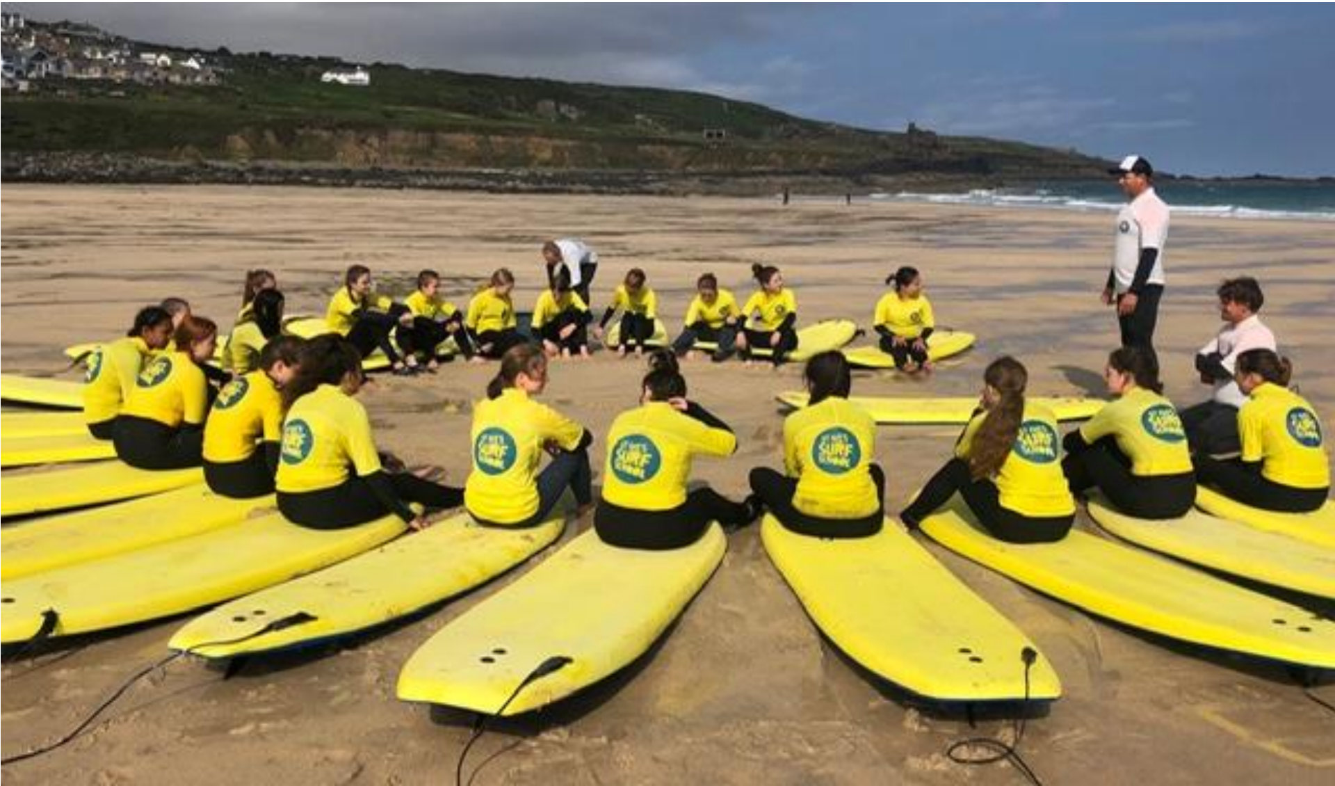
Surf Lesson with St Ives Surf School, Porthmeor Beach